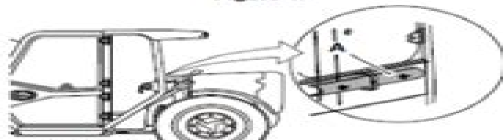
A. Maintenance strut