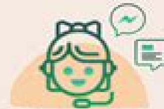
Online Reference Services via Chat-a-Librarian, Email, & Facebook