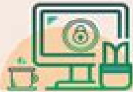
Remote Access to Electronic Resources via VPN