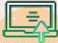
Online Book Borrowing

Library services in the new normal. Visit the library website for more information.