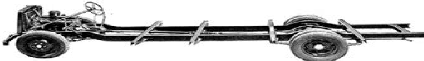
Fahrgestell 3,6—47 in Wirtschaft- oder Wehrmachtausführung

Das Bild zeigt das Fahrgestell 3,6—36. Das Fahrgestell 3,6—42 hat längeren Rahmen und größeren Radstand.