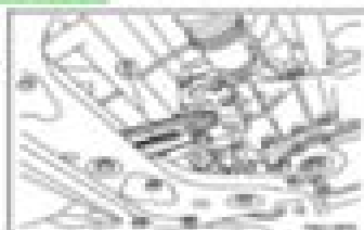
Figure shows A/T models. The shape of the bracket on the transverse side is different for M/T models.