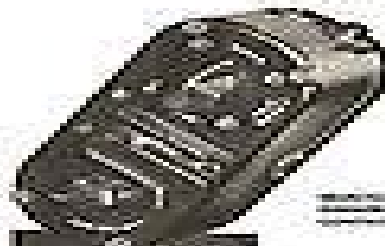
ENGINE ACCESS PANEL HANDLE AND LATCH MECHANISM

The engine access panel is located on the left side of the fuselage, just behind the wing. It is a large, rectangular panel that is hinged at the top and can be opened by pulling on the handle. The panel is made of aluminum and is painted to match the aircraft's overall color scheme. It is secured by a latch and a lock. The panel is used to access the engine compartment for maintenance and inspection. It is important to ensure that the panel is properly closed and locked after use to prevent damage to the engine and other components.