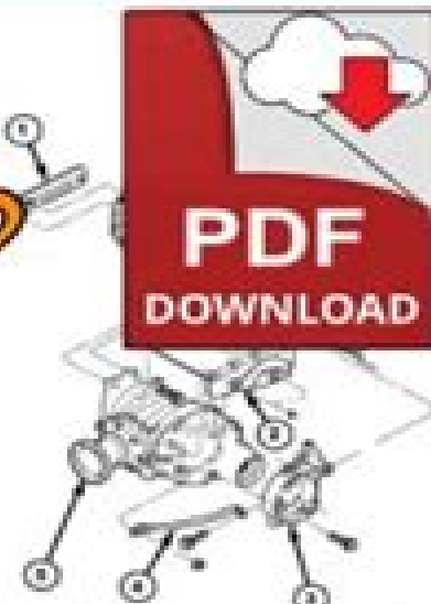
Fig. 6 Power Transfer Unit Mounting