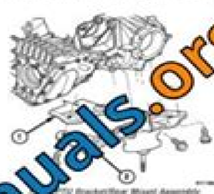
Fig. 4 Power Transfer Unit Mounting