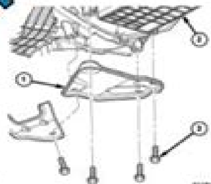
Fig. 5 Old Power Transfer Unit