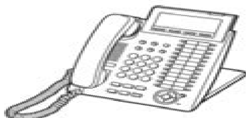
Prikazani je model KX-DT346.

Izlista vam na kućnoj liniji digitalnog gumenog telefona (Digital Proprietary Telephone – DPT). Molimo vas da pre upotrebite proizvođača pušljivo pročitajte ovaj priručnik i da ga sačuvate za potrebe budućeg informiranja. Dodatne informacije potražite u priručnicima za upotrebu PBX-a. Ovaj priručnik sadrži informacije o KX-DT390 digitalnoj DS5 konzoli.