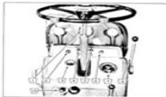
LP Gas Tractor