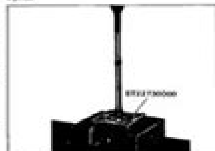
Fig. TB-29 Removing main drive bearing

18. Remove the main bearing from the main shaft by the use of a bearing puller (special tool BT-27100000) and a pin.