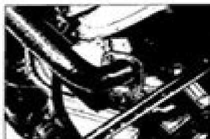
Fig. EB-12 Removing front tube

Remove the front, rear and the back pin, and remove the lever. (The operation is carried out in the previous compartment.)