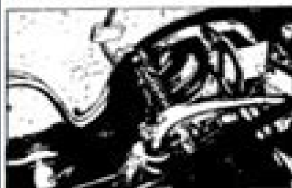
Fig. EB-11 Disconnecting clutch wire

7. Disconnect the cable to the back up lamp switch.