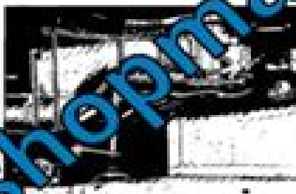
Fig. EB-13 Removing exhaust control rod

12. Remove the front engine mounting installation bolt.