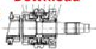
Fig. TB-27 Layout of main shaft

15. Remove the bearing from the counter gear.