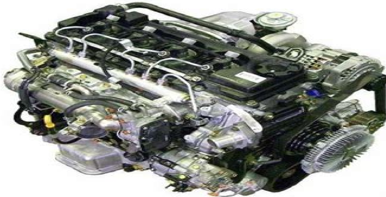
ZD30DDTi Common Rail Diesel Engine