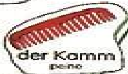
der Kamm peine