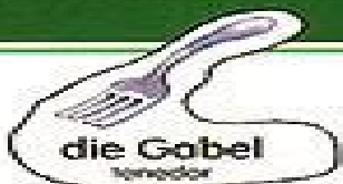
die Gabel tenedor