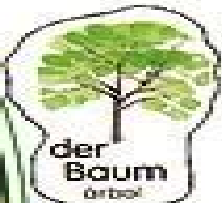
der Baum árbol