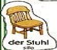
der Stuhl silla