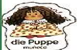
die Puppe muñeca