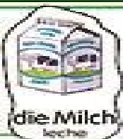
die Milch leche