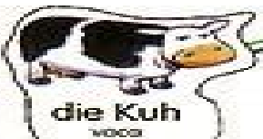
die Kuh vaca