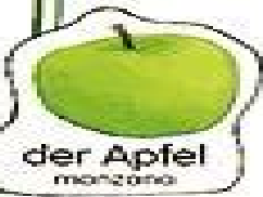
der Apfel manzana

Cada palabra con el objeto que representa en cien pegatinas reutilizables.