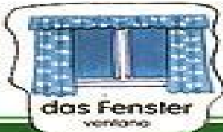
das Fenster ventana