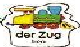
der Zug tren