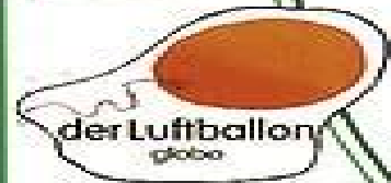
der Luftballon globo