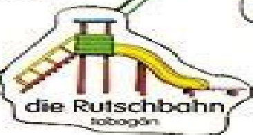
die Rutschbahn tobogán