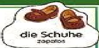
die Schuhe zapatos