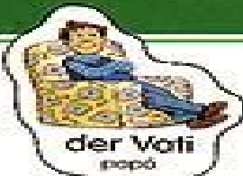
der Voti papá