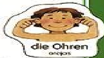
die Ohren orejas