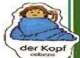
der Kopf cabeza