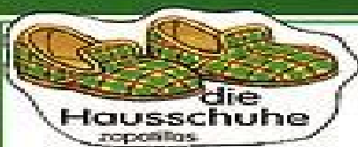
die Hausschuhe zapatos