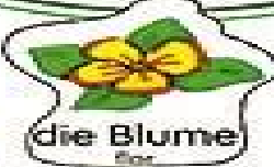
die Blume flor