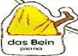
das Bein pierna