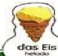
das Eis helado