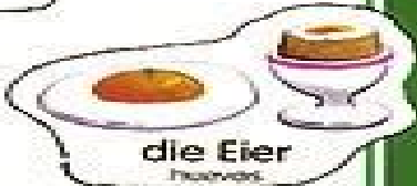
die Eier huevos