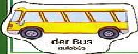
der Bus autobus