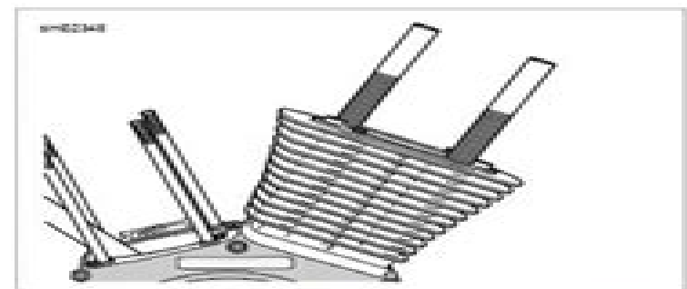
Figure 3-37. Install Threaded Cylinders to Studs