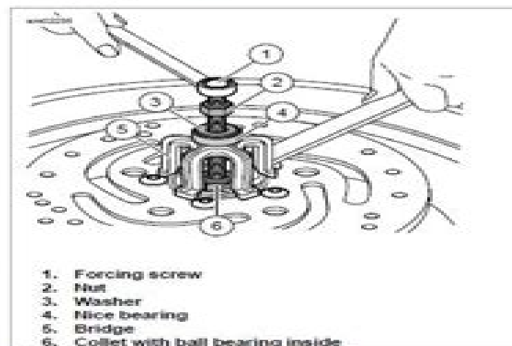
Figure 2-12. Removal Tool