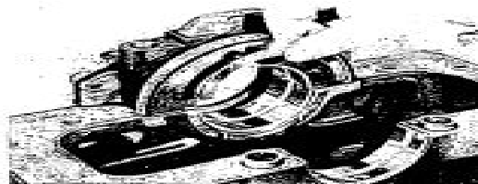
Fig. H.4. Showing correct location of Crankshaft Thrust Washers (Crankshaft Removed).

To check the crankshaft end float, push the crankshaft forward as far as it will go and using feeler gauges check the gap between the machined shoulder on the crankshaft web and the crankshaft thrust washer. See Fig. H.6.