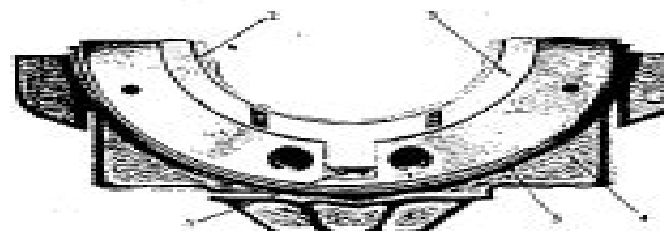
Fig. H.5. Rear Main Bearing Cap. 1. Oil Drain Holes. 2. Bearing Shell. 3. Thrust Washer. 4. Bearing Cap. 5. Cork Seal.