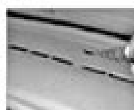
11.49a Lift off the two covers

both covers from the face on both sides (see illustration).