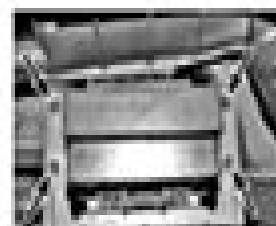
11.47 Under the four bolts (previously) securing the head, insert the mounting bracket in the block