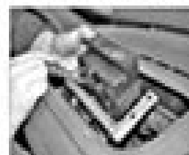
11.48 Release the retaining clip, and remove the head from the top of the conditioned only further from the mounting bracket