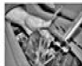
11.49 Then remove the bracket

35 Working through the storage tray (previously) under the four bolts securing the head, insert the mounting bracket in the block (see illustration).