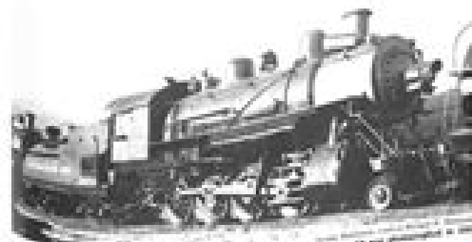
100, coupled on Union Pacific line near St. Louis. The locomotive is dark-colored with a light-colored smokestack and is moving along a track.