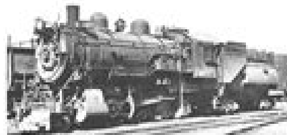
100, coupled on Union Pacific line near St. Louis.

100, coupled on Union Pacific line near St. Louis. The locomotive is dark-colored with a light-colored smokestack and is moving along a track.