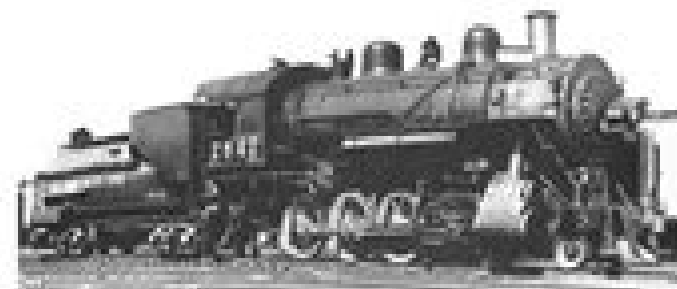
100, coupled on Union Pacific line near St. Louis. The locomotive is dark-colored with a light-colored smokestack and is moving along a track.