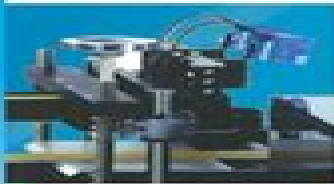
Open flap detection (optional)