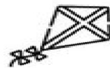
Not doing my best work