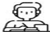
Sitting nicely in my chair