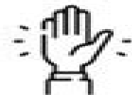
Raising my hand