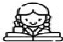
Always trying my best