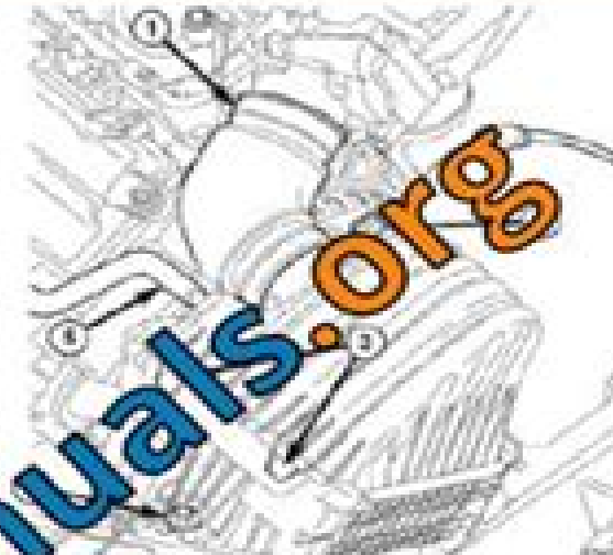
Fig. 44: Removing/Installing Stretch To Fit Power Steering Belt

Disconnect electrical connector (if equipped).