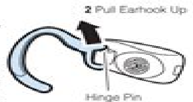
2 Pull Earhook Up