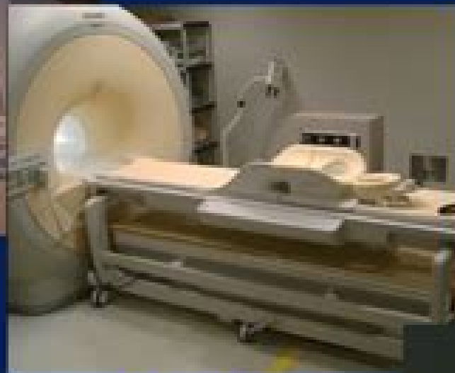
Dedicated : Breast