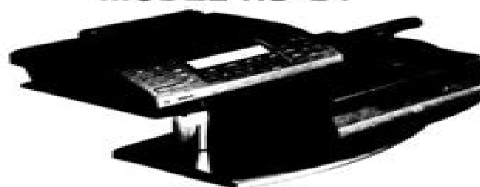
Black and Silver models