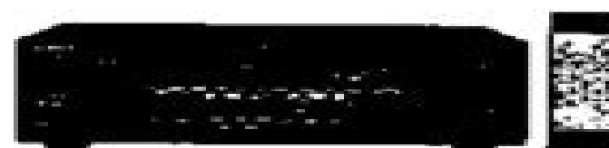
Black, Silver, and Golden models