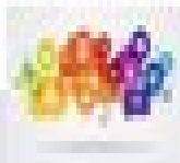
Figure 4: Hospital information system trends

Utilization of digital tools to increase participation and promote positive patient behavior