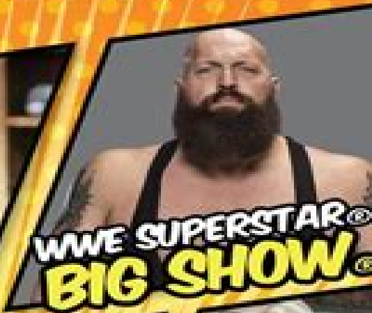
WWE SUPERSTAR® BIG SHOW®