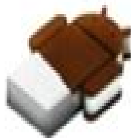
Ice Cream Sandwich