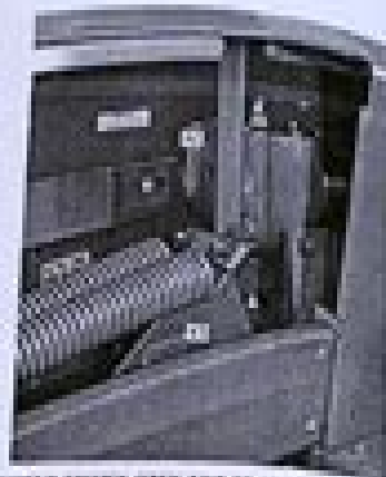
SHIELD ARMOR OPEN FOR CLARITY. FIGURE 28