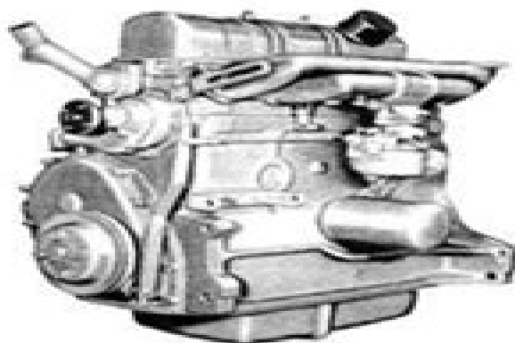
FIGURE 2 - Typical - 4-Cylinder Gasoline Industrial Engine (Left Front View)

Specifications for the models of both, the gasoline and diesel engines, are in Part IV of this manual.