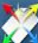
CamScanner Toolbox X