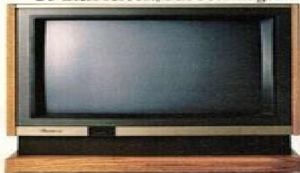
The world's first 35-inch, direct-view television. It's 86% larger than a 26-inch set, and can deliver a stunning 760 lines of resolution.

Which helps explain how in 1986, we were the only television manufacturer with the technology to create a 35-inch conventional tube television. With a picture as sharp and clear as a 26-inch screen, but 86% larger.