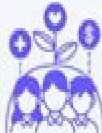
Compensation and Benefits