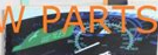
Engine compartment (rear view)