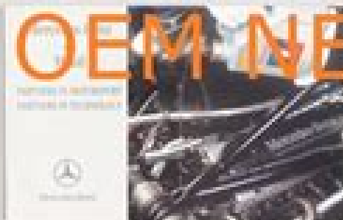
Engine compartment (front view)