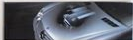
Engine compartment (rear view)