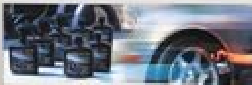
Wheel and tire