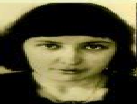
MARINA TSVETAYEVA • HANNAH ARENDT & MARY MCCARTHY • DORIS LESSING