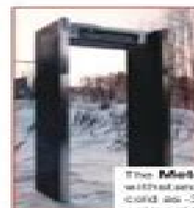
The Meteor 200 WP can withstand temperatures as cold as -30 °C (-22 °F) with optional heater.

All parameters are set through a remote control unit that utilizes passwords to eliminate unauthorized personnel to control the gate. The alphanumeric display on the remote control shows the results of the self-testing diagnostics, traffic counting and parameter adjustment.