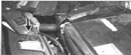
A A poor earth connection can cause intermittent faults in more than one circuit.