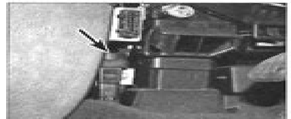
E If the automatic fuel cut-off switch has been triggered, reset it by pressing the rubber disc on top of the switch. Located inside the vehicle, to the left of the clutch pedal.