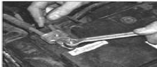
B Check the security and condition of the battery connections.