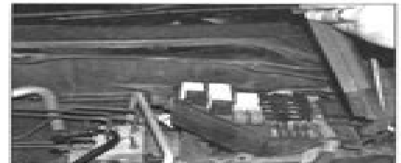
D Check the main fuse links, fuse and relays in the engine compartment fusebox.

Check that electrical connections are secure (with the ignition switched off) and spray them with a water-dispersant spray like WD-40 if you suspect a problem due to damp.