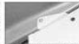
2-7: Radiator assembly (from side view of the radiator)