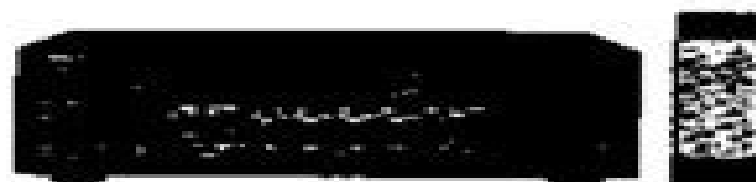
Abstract: Small, shell-less, invertebrates