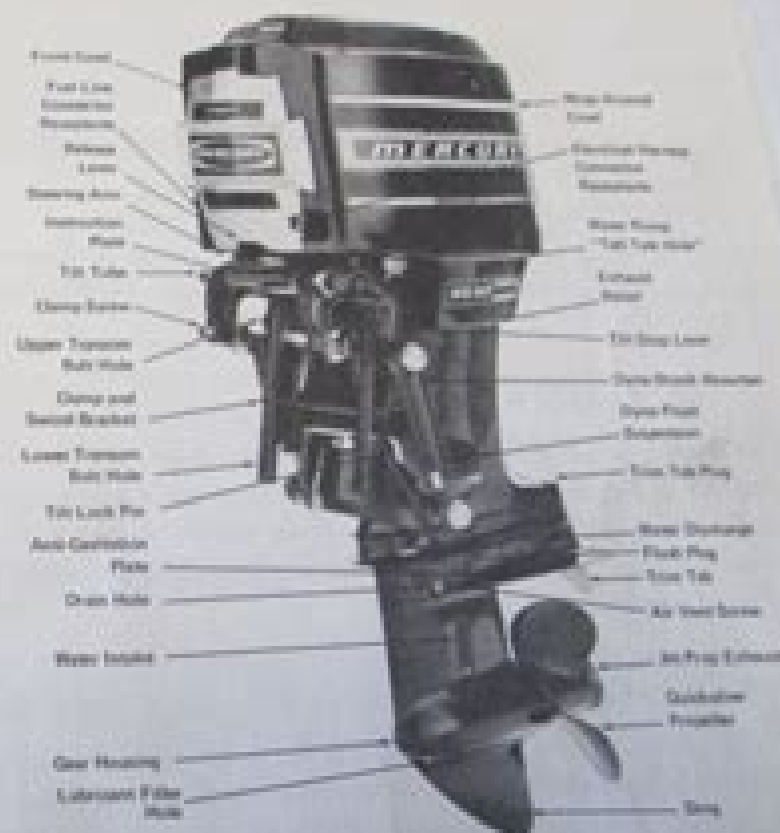
Figure 1. Merc 650 (3-Cyl.)