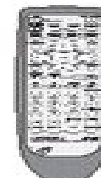
PC-440 DV (MDD)