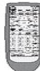
PC-450 DV (MUP, MUT, MUS, MUR)