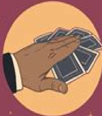
The Magnetic Hand