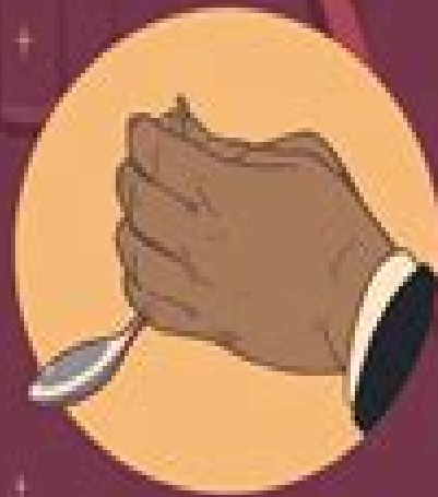
The Spoon Bend