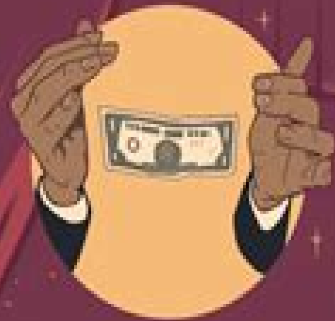
The Levitating Dollar