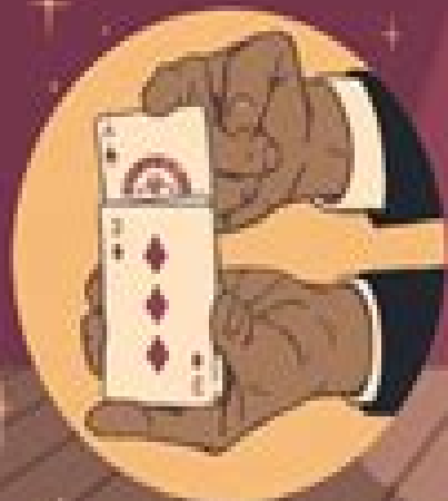
The Rising Card