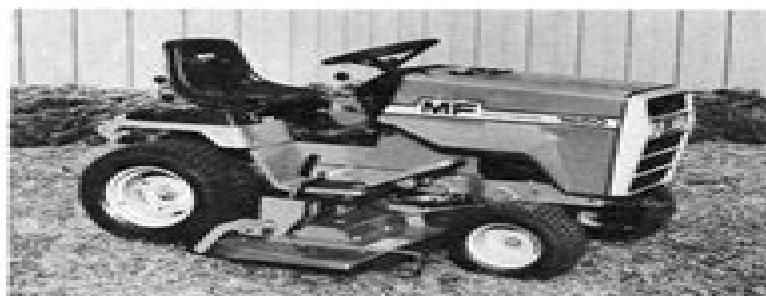
MF 1450 AND MF 1650 GARDEN TRACTORS AND MOWERS