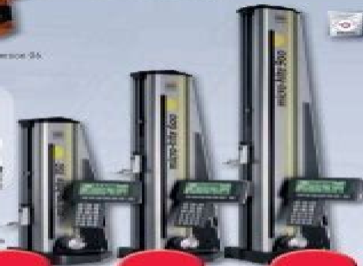
Prices 2 + 3 + 1 pm